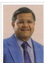
George A. Santos